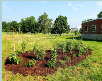
East Petersburg Educational Community Garden

The Borough will also continue to update the current MS4 conveyance system.